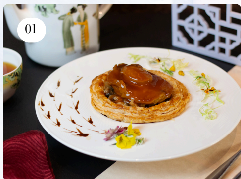
01. 黑松露一头鲜鲍鱼挞 Baked Abalone Tart with Black Truffle $68++ (U.P. $138++)