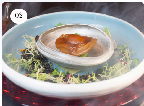
02. 茗茶熏一头鲜鲍鱼 Smoked Abalone with Premium Tea Leaves $68++ (U.P. $138++)