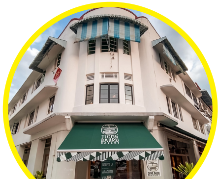
Tiong Bahru Bakery