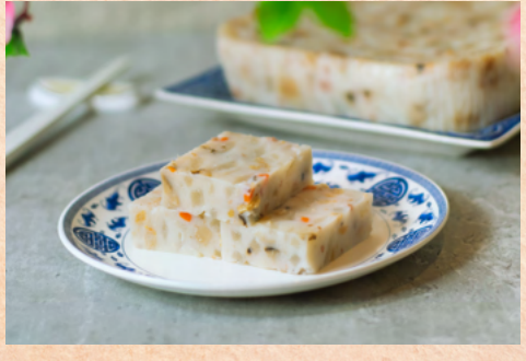
RADISH CAKE WITH PRESERVED MEAT 金牌腊味萝卜糕