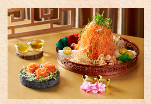
XIN'S SALMON YU SHENG 新故乡鸿运三文鱼捞起

Feast on luxurious classics to kick-start a bountiful year with perennial favourites brimming with premium ingredients. Huat ah!