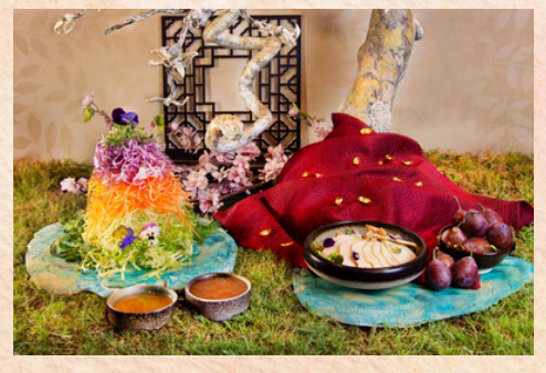
XIN'S 2-HEAD ABALONE YU SHENG 二头鲍鱼捞起