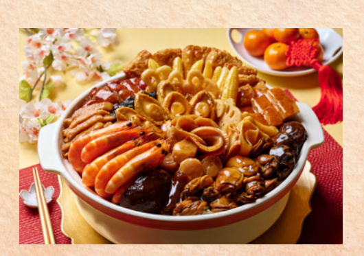
TRADITIONAL PEN CAI 合家欢传统盆菜